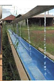
Book Hand over ceremony at Nayang secondary school, Nambak district Laungprabang Province